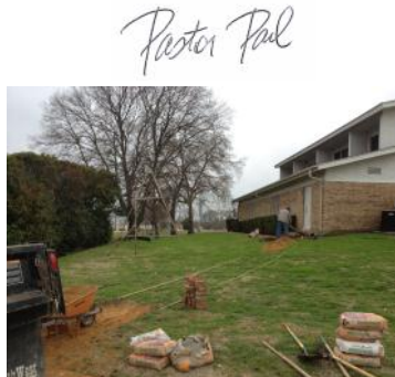
Creating a "new" sidewalk