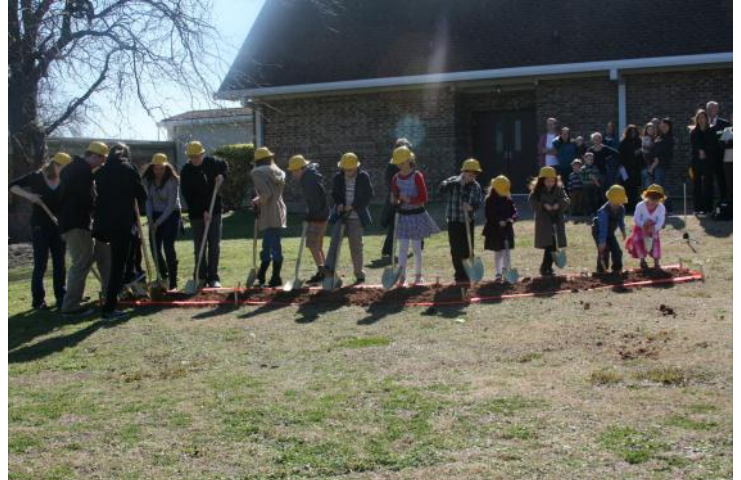
One child from each class turns dirt for the Building Out to Reach Out campaign