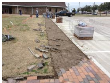
Pulling up the current sidewalk

You can see change is happening already! Looking forward to REACHING OUT as our building out is complete later this year.